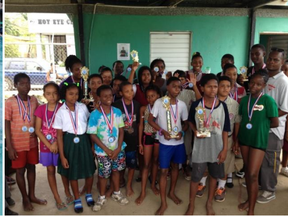
Winners of the 9 th Annual Fiona Stevenson Swim Meet

The Fiona Stevenson Fund also funded the training of twenty-one (21) young men and women, who participated in both the Lifeguard and Swimming Instructor Courses. First Aid and Leadership Skills Training were incorporated in the courses. At the end of the training the participants were certified by the Belize Red Cross. During the summer, the twenty-one (21) lifeguards/swim instructors played a key role in assisting the Y.W.C.A. in its Learn-to-Swim Summer Programme, where they taught approximately one hundred and twenty-five (125) toddlers, children, young adults, and adults how to swim. This opportunity gave the newly-trained lifeguards/swim instructors a chance to become more confident and assertive as lifeguards and to improve their teaching skills as swimming instructors. The opportunity also provided them with income, which helped them with school-related expenses.