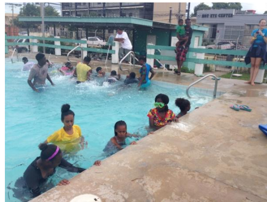
Newly-trained swim instructors/lifeguards teach students how to swim