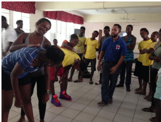
Swim Instructor/Lifeguard trainees receive CPR training

The Fiona Stevenson Fund also funded the training of twenty-one (21) young men and women, who participated in both the Lifeguard and Swimming Instructor Courses. First Aid and Leadership Skills Training were incorporated in the courses. At the end of the training the participants were certified by the Belize Red Cross. During the summer, the twenty-one (21) lifeguards/swim instructors played a key role in assisting the Y.W.C.A. in its Learn-to-Swim Summer Programme, where they taught approximately one hundred and twenty-five (125) toddlers, children, young adults, and adults how to swim. This opportunity gave the newly-trained lifeguards/swim instructors a chance to become more confident and assertive as lifeguards and to improve their teaching skills as swimming instructors. The opportunity also provided them with income, which helped them with school-related expenses.