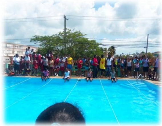
Students and teachers prepare for Competition