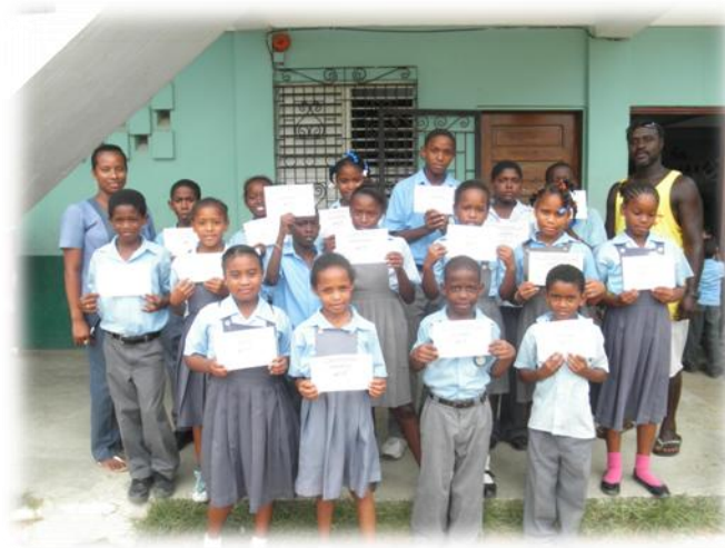
Queen Street Baptist School