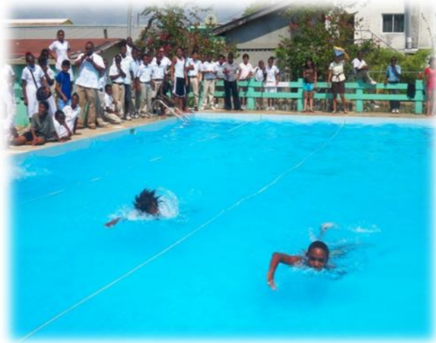
Students were very competitive and were eager to show off their skills