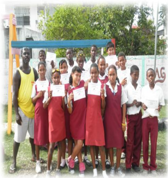
Central Christian School