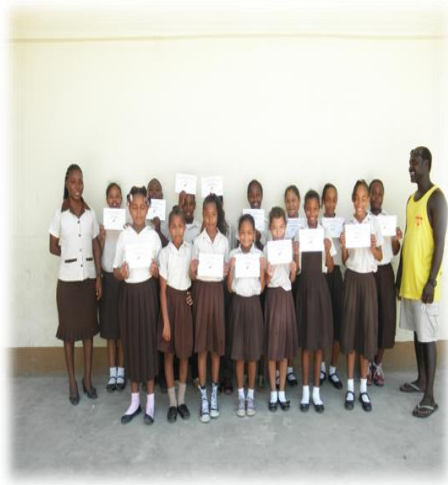
James Garbutt S.D.A School

All of the Students who participated in the “Learn to Swim Programme” received Certificates.