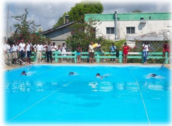
Teachers eagerly watching the competition