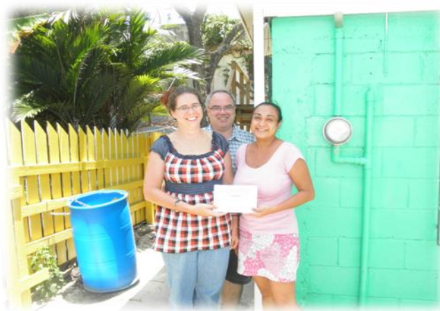
Teachers of Friends Boys School