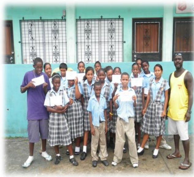
Salvation Army School