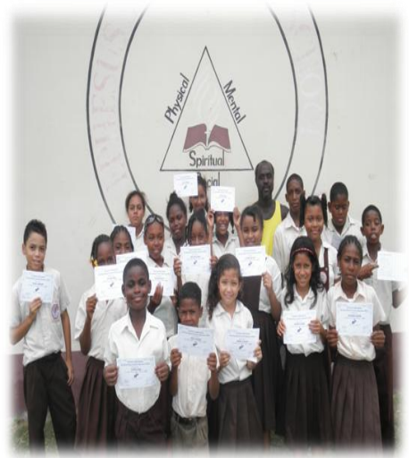
Ephesus S.D.A School