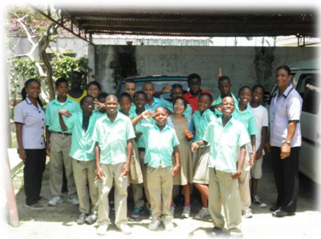
Stella Maris School